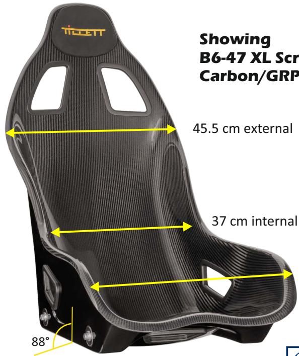
Showing B6-47 XL Screamer Carbon/GRP

B6 XL Screamer seats are matched to bracket sets PTBi, PTBO, TBFiA, STBi, STBO, and Elise brackets EBR, EBR 17+, EBS, EBP. These brackets have a 2° from vertical angle, which matches the side of the seat. Brackets which do not match this angle will unduly stress the composite.