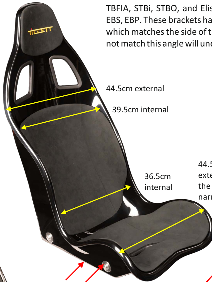
B8-44.5 GRP with Dinamica suede panels

B8 seats are matched to bracket sets PTBi, PTBO, TBFIA, STBi, STBO, and Elise brackets EBR, EBR 17+, EBS, EBP. These brackets have a 2° from vertical angle, which matches the side of the seat. Brackets which do not match this angle will unduly stress the composite.