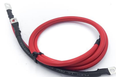
Upgraded battery cable supplied